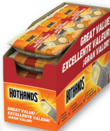
VALUE PACK OF 6 PAIRS DISPLAY OF 9 UNITS HH-TW6PREF / 094733100069