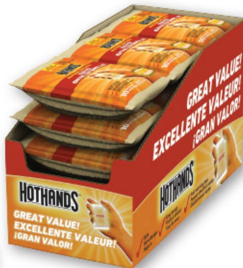
VALUE PACK OF 10 PAIRS DISPLAY OF 8 UNITS HH-HH2UDW80F 094733070102