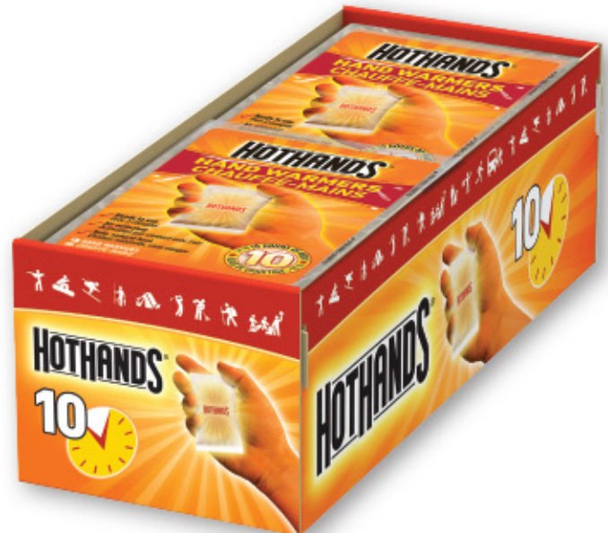
DISPLAY OF 40 UNITS HH-HH2UD40F / 094733075893