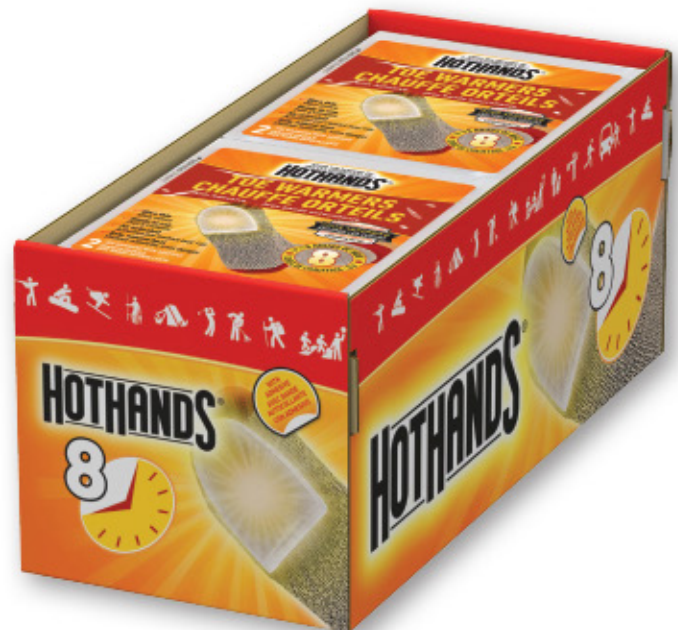
DISPLAY OF 30 UNITS HH-TTUD30F / 094733100014