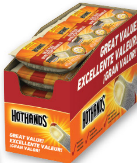
VALUE PACK OF 6 PAIRS DISPLAY OF 9 UNITS HH-TW6PREF / 094733100069