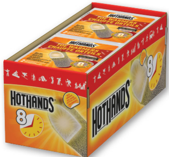
DISPLAY OF 30 UNITS HH-TTUD30F / 094733100014