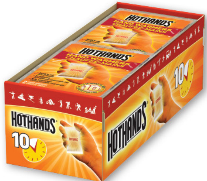
DISPLAY OF 40 UNITS HH-HH2UD40F / 094733075893