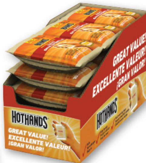
VALUE PACK OF 10 PAIRS DISPLAY OF 12 UNITS HH-HH2UDW80F 094733070102