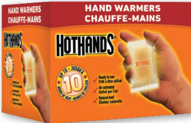
DISPLAY OF 20 UNITS HH-HH2UD20F / 094733075893