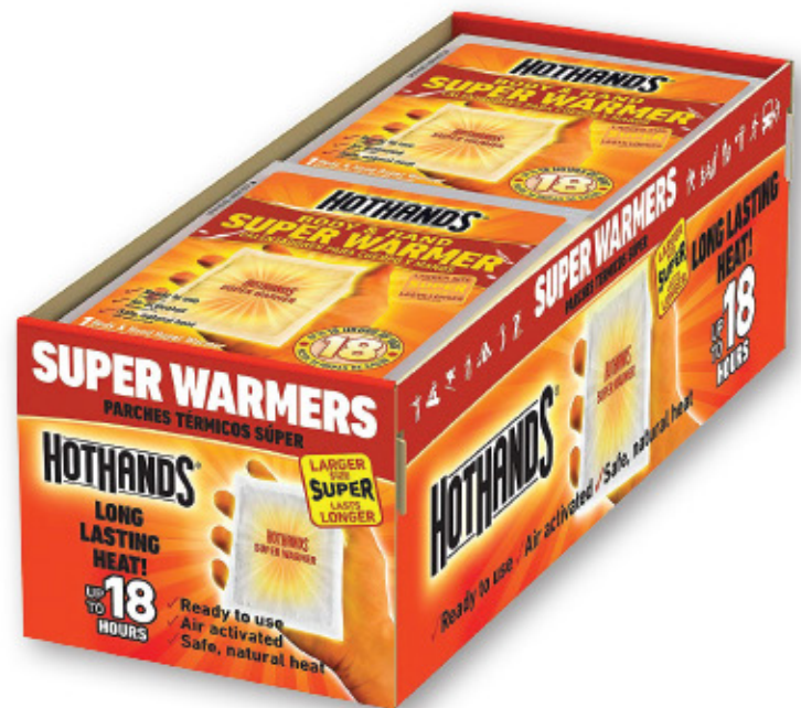
DISPLAY OF 40 UNITS HH-HH1UD40F / 094733155892