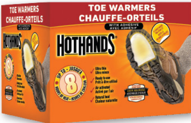
DISPLAY OF 20 UNITS HH-TTUD20F / 094733100014